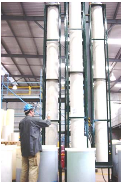
Four metre column leaching in progress