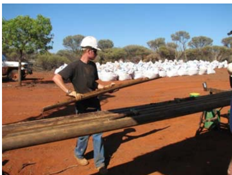
Calweld Bulk Samples