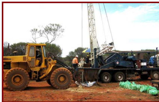
Calweld Drilling Operations

Drilling was designed to provide representative samples of all ore types through the Jump-up Dam deposit. The samples were transported to SGS Oretest in Perth for sample preparation and testing.