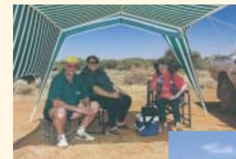
The Heron Team at the Balzano Barrow Race.