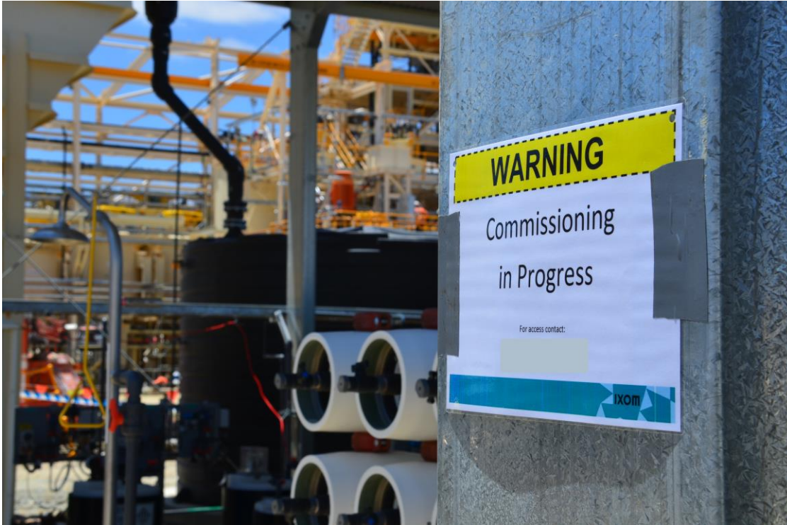
Figure 4: Water treatment plant commissioning well underway

An integral component of the Woodlawn process plant is the water treatment plant that is well into the commissioning phase. This important area has been configured to allow treatment of any out of specification surface and underground water into high-quality make up water suitable for use in the processing operations.