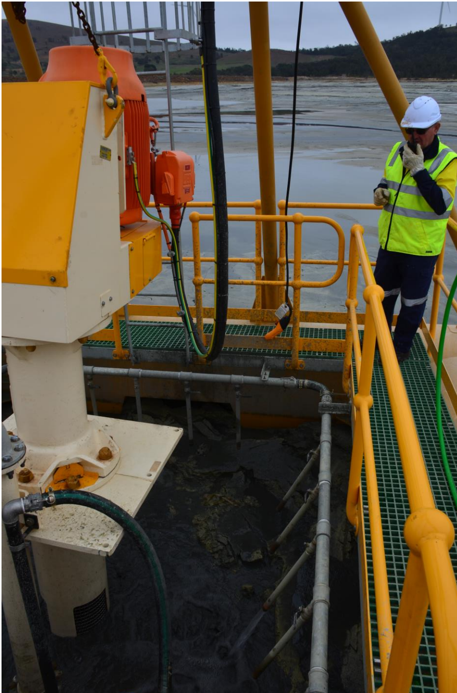
Figure 1: Operational testing of the tailings reclaim barge on Tailings Dam South (TDS)