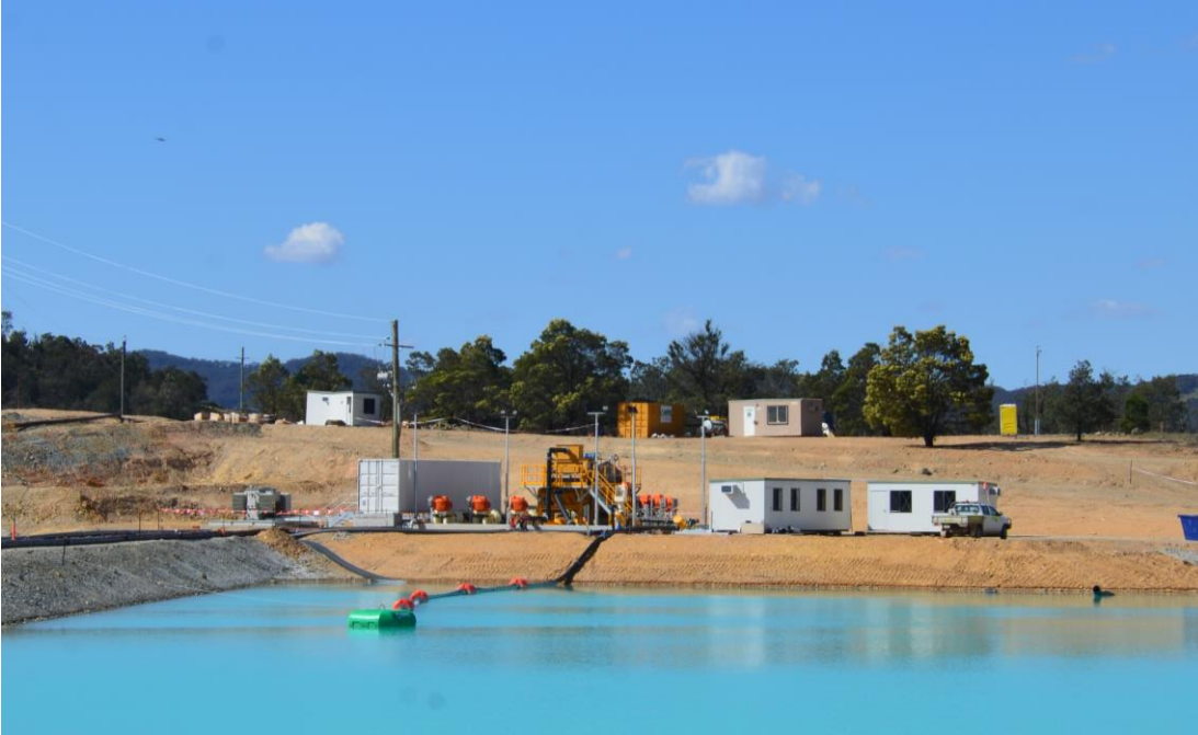
Figure 2: Hydraulic mining water reclaim, trash screen and transfer pump station

Commissioning activities are expected to ramp up over a 4 to 8 week period and will include the hydraulic excavation of the main channels in preparation for ore commissioning of the process plant with progression to full production rates.